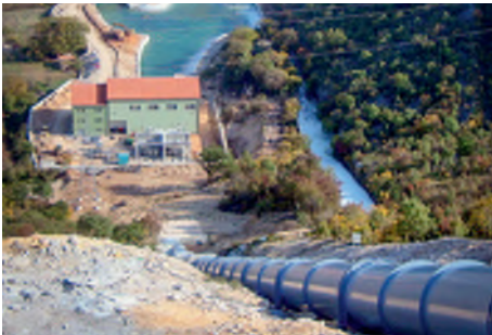
Mostarsko Blato HPP