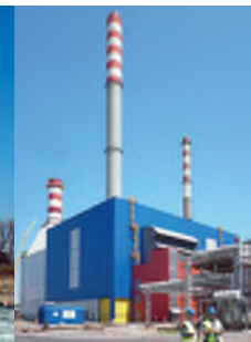
Sisak CCCPP - 250 MW e / 50 MW t Unit C