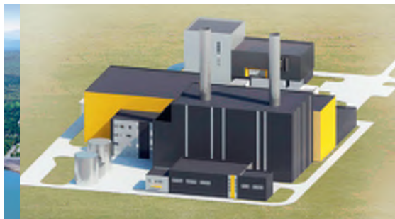
Slavonski Brod CCCPP- 600 MW, 2x250 MW e