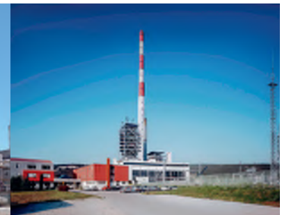
125 MW Plomin 1 TPP and 210 MW Plomin 2 TPP