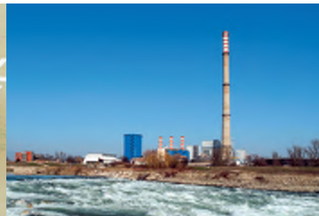
TE-TO Zagreb CCCPP - 208 MW e / 140 MW t Unit K TE-TO Zagreb CCCPP - 100 MW e / 80 MW t Unit L