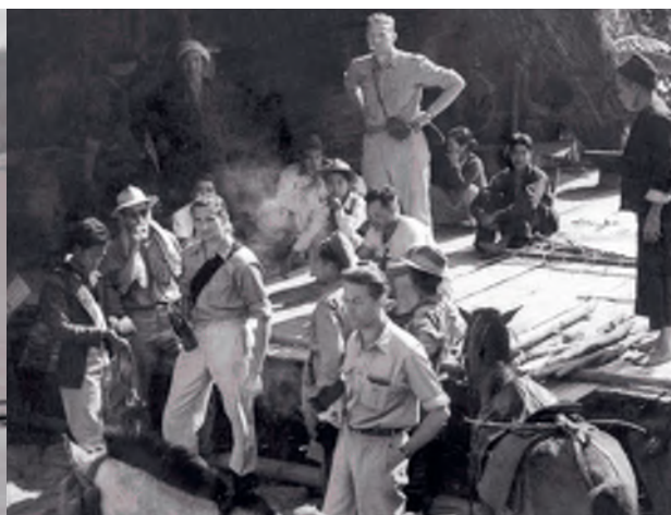
Elektroprojekt in Burma