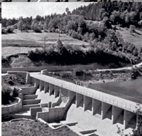
Vinodol HPP – Bajer Dam