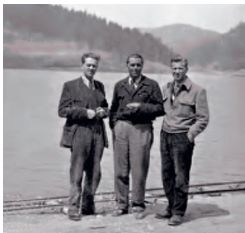
Vinodol HPP construction

The results of work of Elektroprojekt experts constitute a unique archive of more than 23,000 design volumes, including design documentation for the majority of hydroelectric power plants and thermal power plants and other facilities built in the Republic of Croatia. Since its establishment, Elektroprojekt has maintained its core business and expanded its field of activities based on the circumstances and requirements of the economic development and market demands. Thus, in addition to water resources management, environmental and nature protection, the scope of Elektroprojekt activities expanded to include the utilization of renewable energy sources, such as wind and solar energy, biomass and geothermal energy, and to infrastructure projects such as tram rails and cable cars.